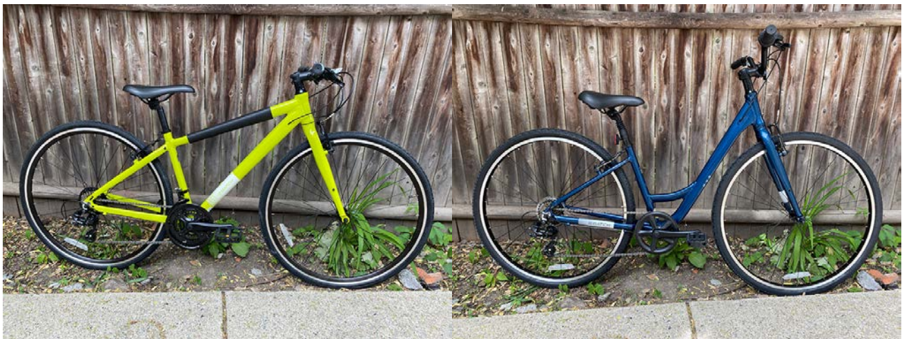
Batch Fitness Bike