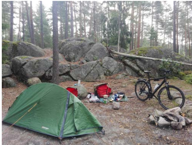
This summer, Jamaica Plain On-The-Bike students aged 15-18 will will embark on a three-day overnight bike tour to Ponkapoag and Wompatuck Campgrounds!

Bikes Not Bombs is accepting applications for summer Bike School at our Jamaica Plain and Roxbury locations. Programs include: Bike Institute, Earn-A-Bike, On-The-Bike, and Sisters In Action.