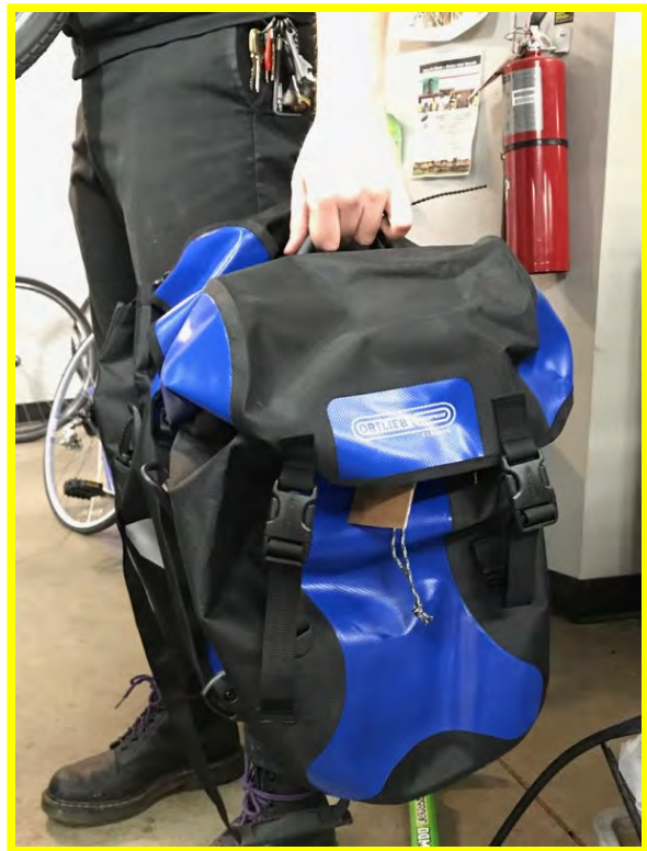
Ortlieb's Panniers and Backpacks