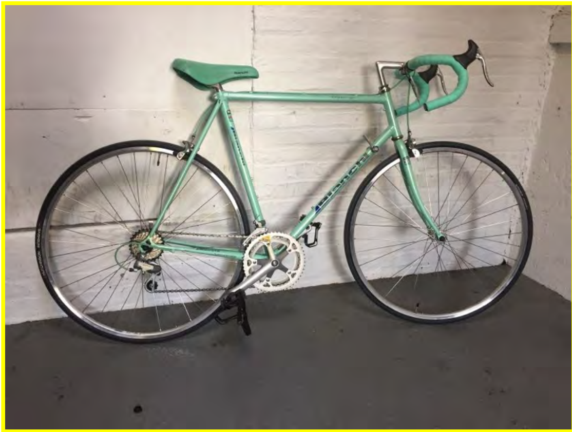
"Celeste is Bianchi, Bianchi is Celeste": This mint vintage classic Celeste Bianchi features the classic set up, drop bars, downtube shifters and full shimano 600 group set. Matching saddle is a plus! Wonderful summer road bike.