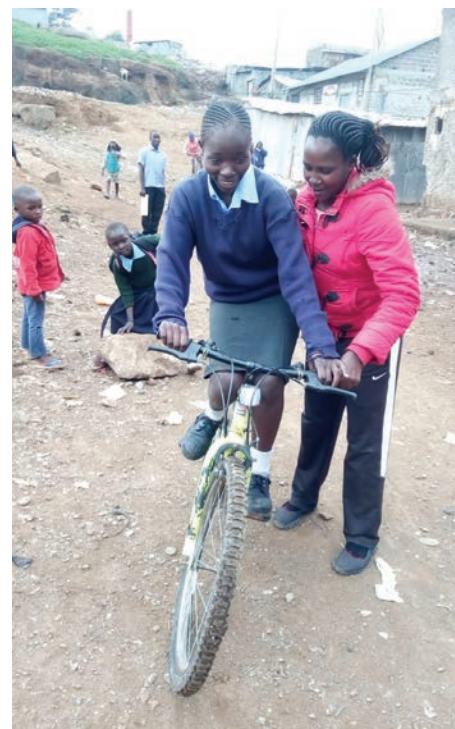
Learn to Ride, Cycloville, Kenya