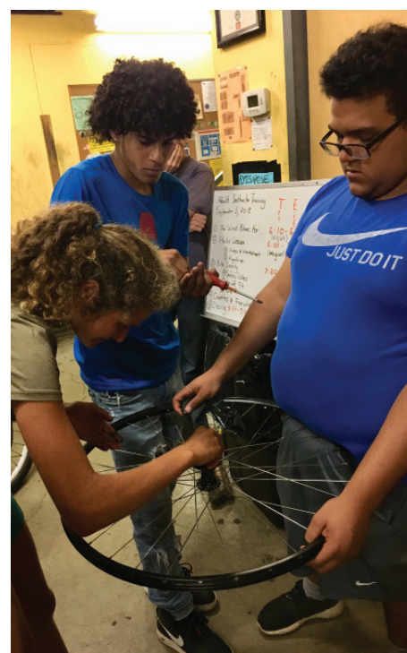
Youth Instructors, Adult Instructor Training Class, BNB Hub