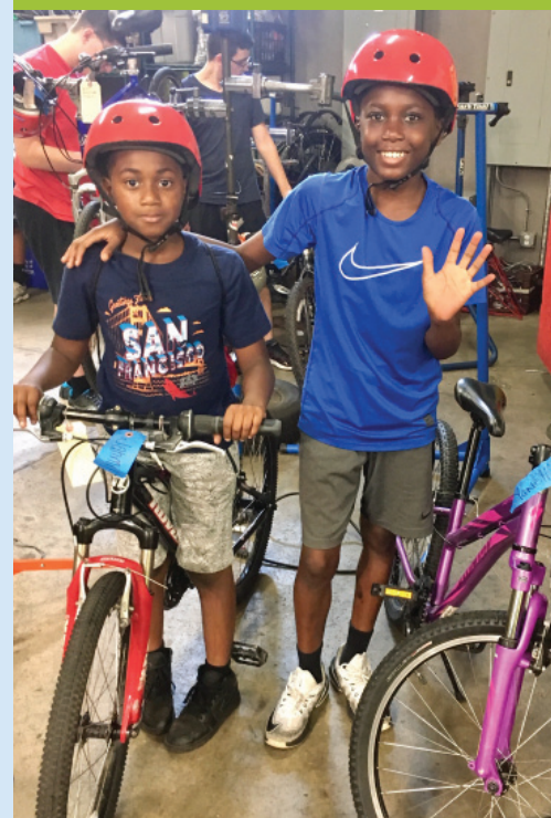
Earn-A-Bike, Boston, MA