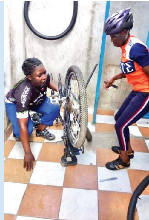
Women's Bicycle Project, Cycloville, Kenya

We are excited to report ongoing progress in clarifying our mission statement. In our next strategic plan, we have refined our target population (who we exist to serve) so there is a greater focus on meeting the needs of youth, women, and people of color - people who are marginalized in the bike industry and our broader society. As we Gear Up For Growth, we are committed to evolving to better meet community needs and advancing equity and social justice.