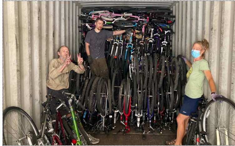
Our volunteers make it possible to send quality bikes and parts to our partners in the Global South. (Container Loading to LWD Rwanda)