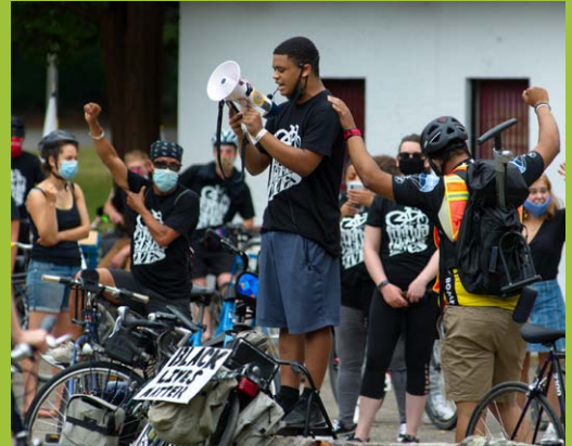
Ride for Black Lives June 2020

Bikes Not Bombs commits to meeting the needs of our target population: primarily Black, Indigenous, and People of Color (BIPOC) living in the Boston communities of Dorchester, Mattapan, and Roxbury, and nations in the Global South. As we Gear Up for Growth, we are committed to evolving to better meet the needs of the community and advancing equity and social justice.