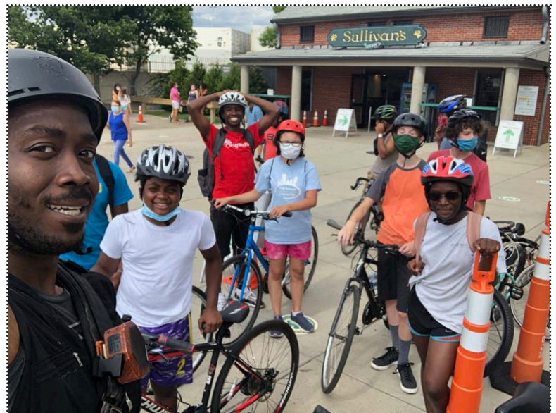
Summer 2020 On-The-Bike participants pedaled from Jamaica Plain to Castle Island, MA!